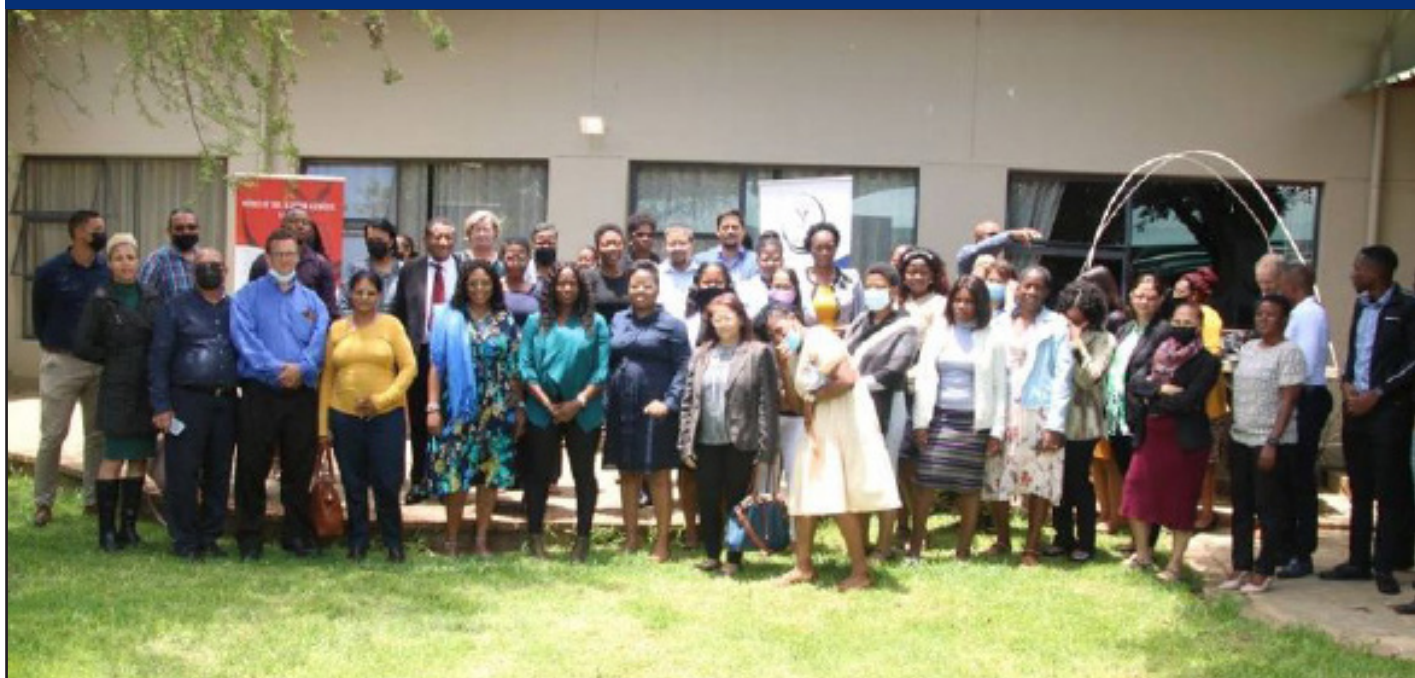
STRATEGIC MOVES.....OAG staff members pose for a group photo during the Strategic Review Workshop held at Heja Lodge.